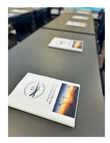
Basic course textbooks

Course registration will open on February 1<sup>st</sup>, 2025. Please feel free to pre-register via email (please send us your contact information and indicate which course you are interested in attending).