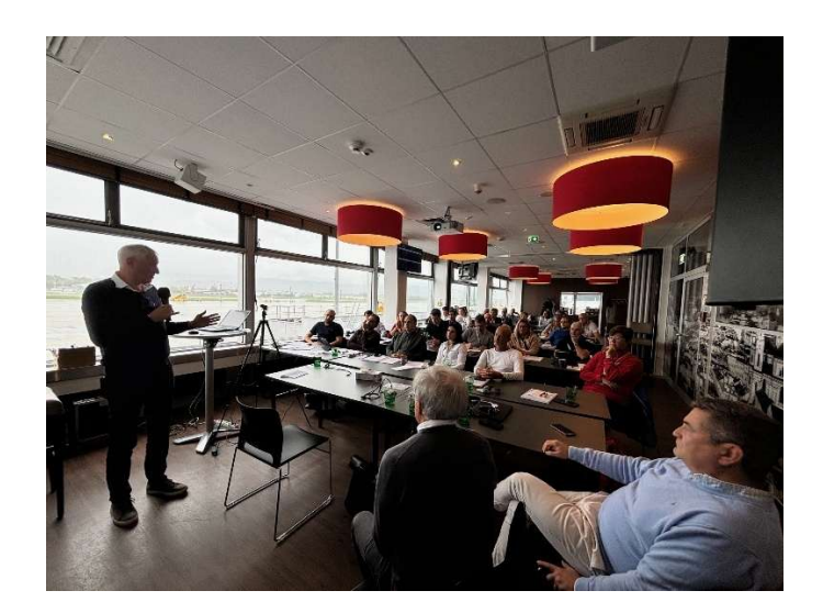
Salzburg Aerospace Medicine Seminar refresher training 2024

Online participation: € 375 (refresher training hours credited are the same for live and on-line participation)