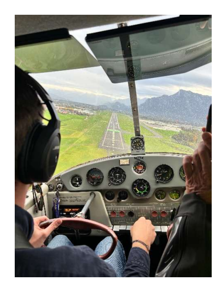
Basic course flight experience