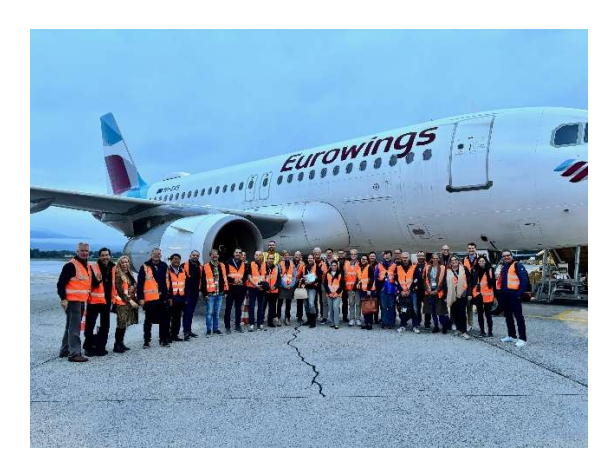
Participants of the 2024 Basic Course on the ramp of Salzburg Airport

class 1 and 3 aeromedical examinations, comprehensive mental health assessments, ophthalmology review (with C1 emphasis), ATCO specific topics, discussion of critical cases, and a visit to the air traffic control unit at Salzburg Airport.