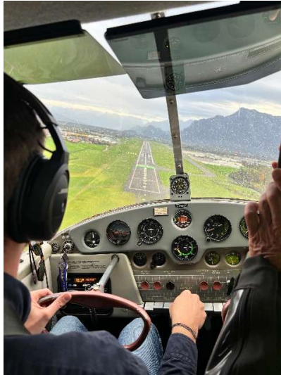
Basic course flight experience