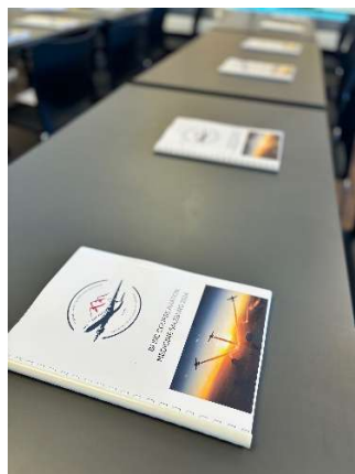
Basic course textbooks

Course registration will open on February 1 st , 2025. Please feel free to pre-register via email (please send us your contact information and indicate which course you are interested in attending).