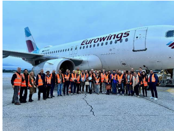
Participants of the 2024 Basic Course on the ramp of Salzburg Airport

class 1 and 3 aeromedical examinations, comprehensive mental health assessments, ophthalmology review (with C1 emphasis), ATCO specific topics, discussion of critical cases, and a visit to the air traffic control unit at Salzburg Airport.