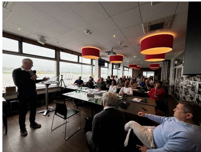
Salzburg Aerospace Medicine Seminar refresher training 2024

Online participation: € 375 (refresher training hours credited are the same for live and on-line participation)